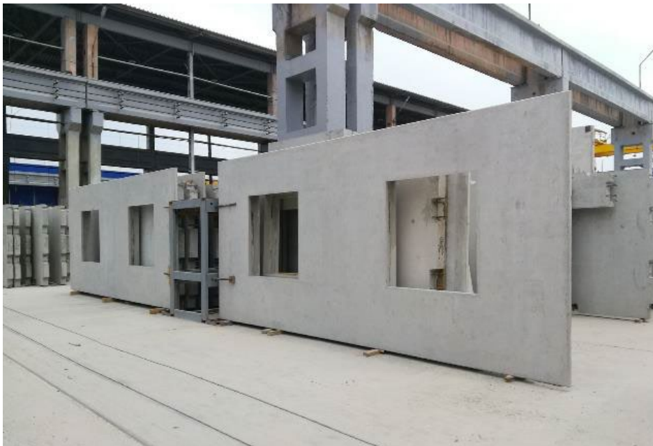
Image 10 Sandwich walls are ready for transport to the construction site.