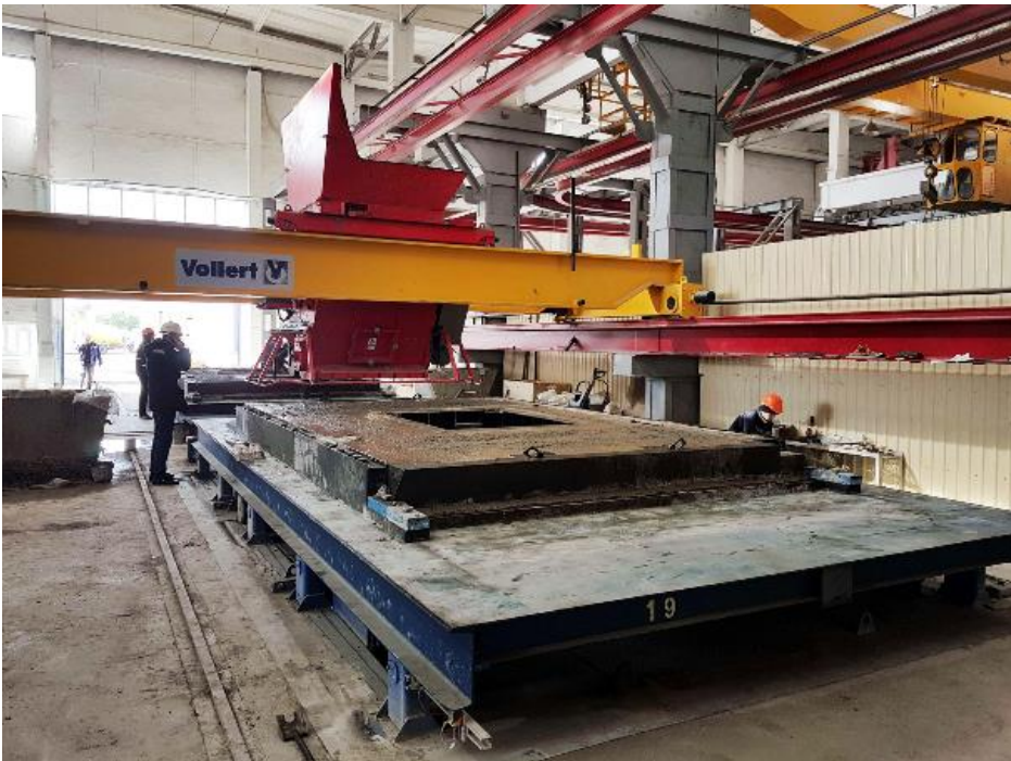
Image 2 Specially designed sandwich walls are key in terms of the load capacity in DSK Binokor's building system, including in an environment where strong earthquakes may occur.