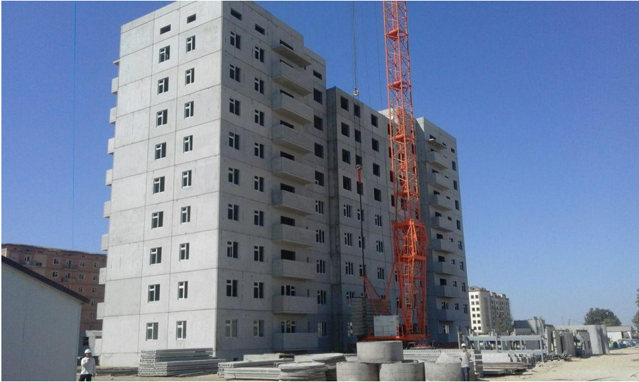
Image 1 Just a few years ago, multi-story building systems were not technically feasible in Uzbekistan due to persistent seismic activities. Today's architecture opens up entirely new possibilities.