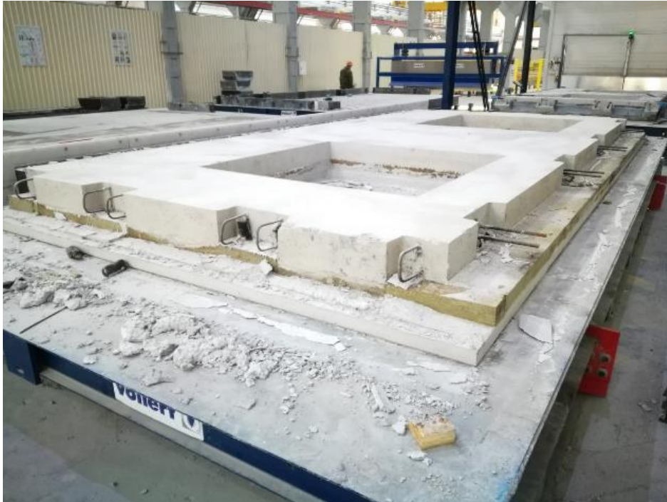
Image 9 The new construction system passed the test on earthquake stability in October 2018.