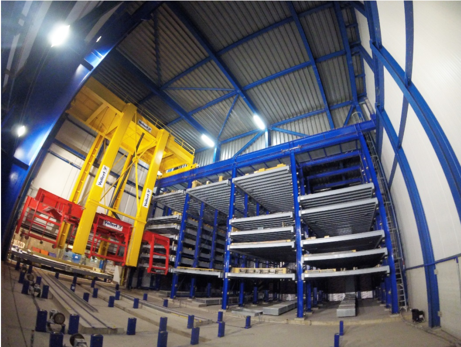
Image 5 A Vario STORE storage and retrieval machine serves the rack towers of the curing chamber.