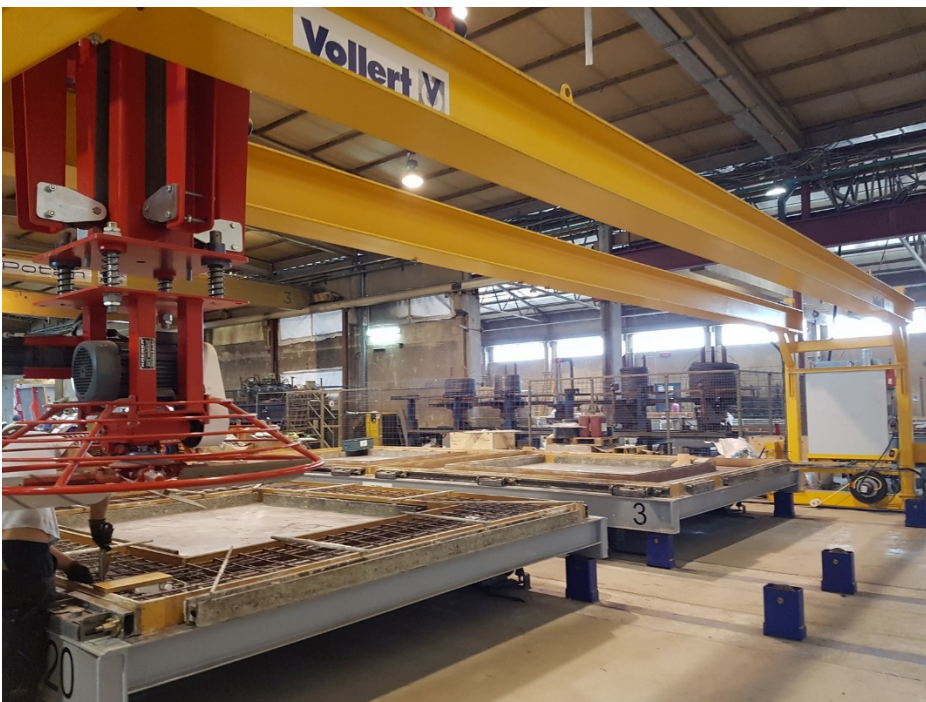
Image 6 Concrete trowelling machine in portal design provides for fair-faced concrete surfaces and the premium quality demanded.